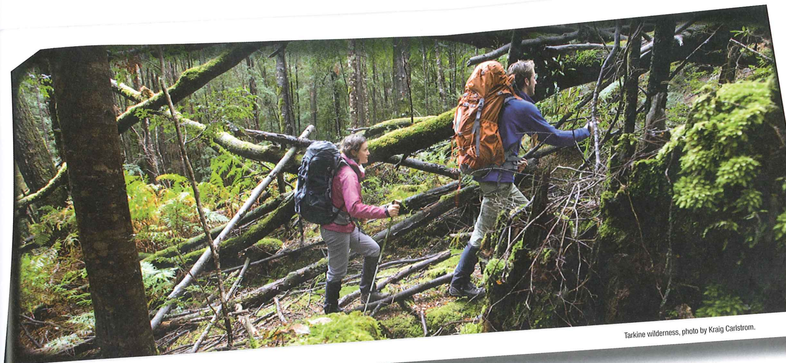
Tarkine wilderness, photo by Kraig Carlstrom.